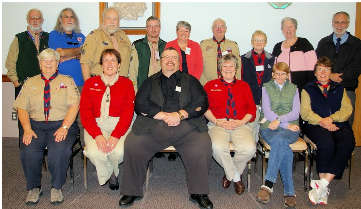
ONTARIO AGM 2011

After a last-minute change of venue, 15 members representing a quorum of Ontario Guilds met in London on Sunday afternoon for the annual meeting. Joining them, via Skype were members of four additional guilds.