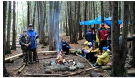
Camp Fire, 2011 JOTA, Apple Hill Scout Reserve