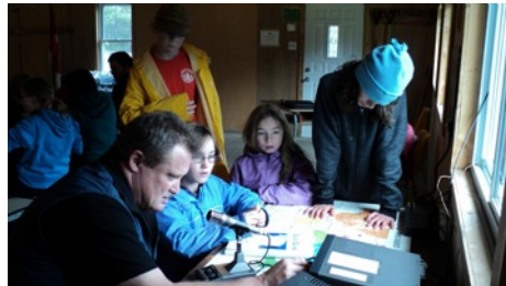
2011 JOTA, Making contact, Apple Hill Scout Reserve