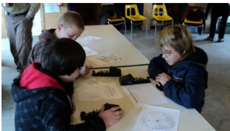
2011 JOTA, Practicing Morsecode, Apple Hill Scout Reserve