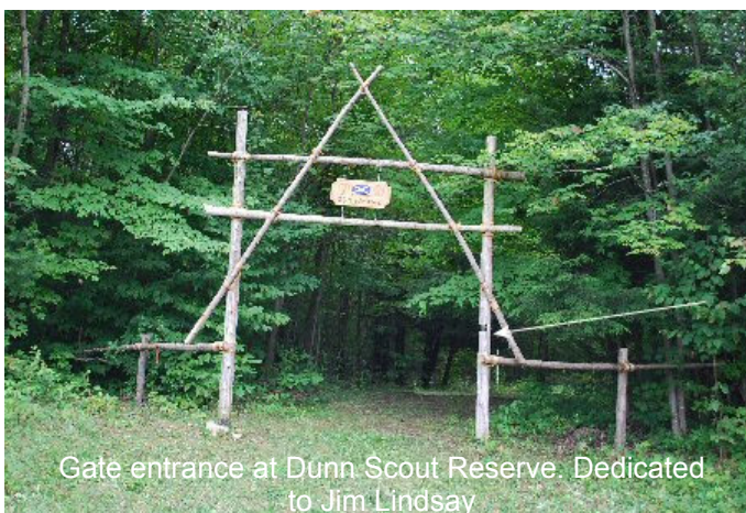
Gate entrance at Dunn Scout Reserve. Dedicated to Jim Lindsay

We are planning many activities within the year to celebrate this great