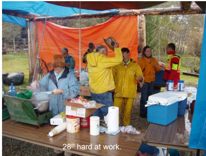
28th hard at work.