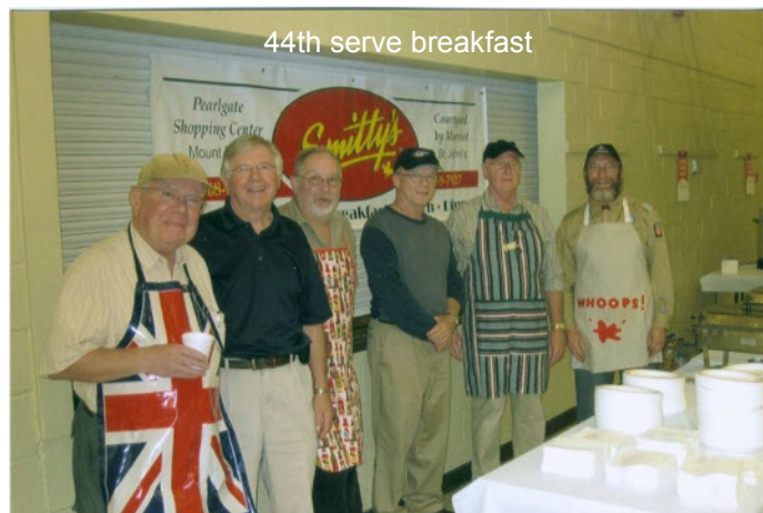
44 th serve breakfast

The 44 th B-P Guild, St. John's, NL took up the challenge and participated in a two & a half hour trek on Saturday, May 9, 2009. Seven members of our Guild re-traced a hike done by Baden Powell in 1935 when he visited "Felach na Gael", a log cabin of the 1st. St. Andrews Rovers at Three Pond Barren, NL Unfortunately, the trail is over grown and the cabin no longer exists, however, the site is still there.