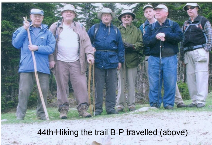
44 th Hiking the trail B-P travelled (above)