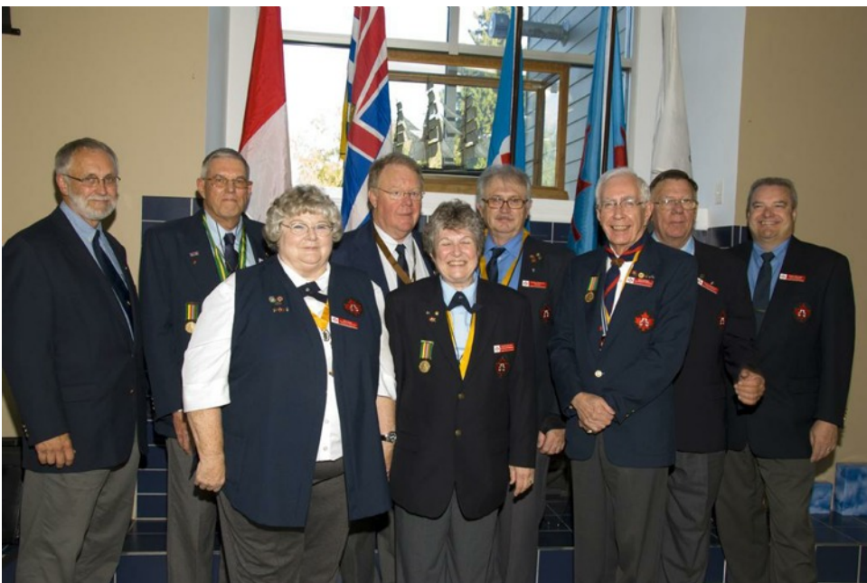
Executive Committee, Provincial Guildmasters and appointees

The recipient of the 2010 Canadian Fellowship of B-P Guilds Scholarship started Scouting as a Beaver and has progressed to achieve the Chief