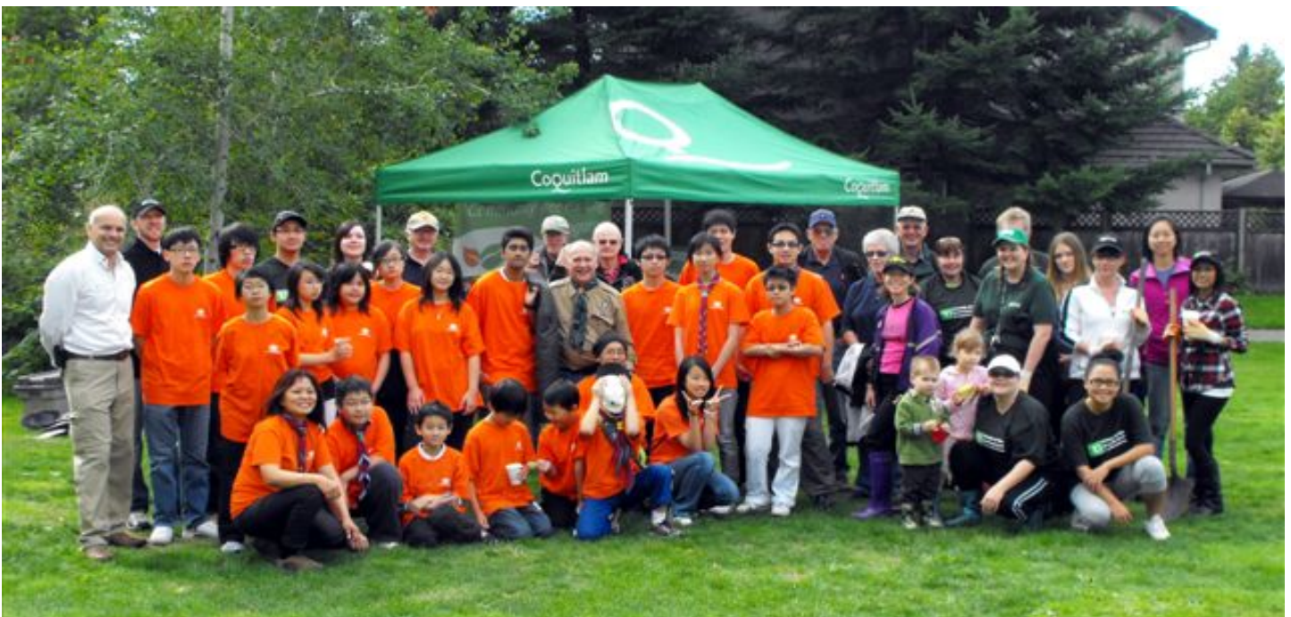
As part of the Canadian Shoreline clean-up week, in cooperation with the City of Coquitlam and working with TD Bank employees and other volunteer groups, Coho Area Scouting and the 40th B-P Guild organized an invasive species clean-up day at Norm Staff Park. The day was perfect and 29 volunteers equipped with energy, smiles and a commitment to the environment.