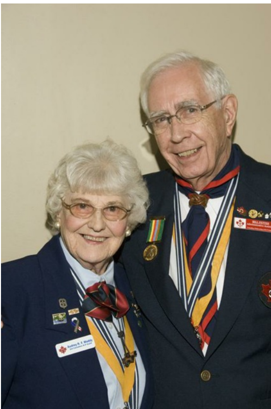
The President's Award of Appreciation, past recipients: